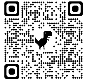
QR Code for Online Events Schedule

We invite K-12 students to create original art. Challenge groups: High School, Middle School, Elementary School. 2022 Theme: Create an original poster on The Universal Declaration of Human Rights. Deadline for submissions: September 20. https://peacequestgreaterlansing.org/art-contest/